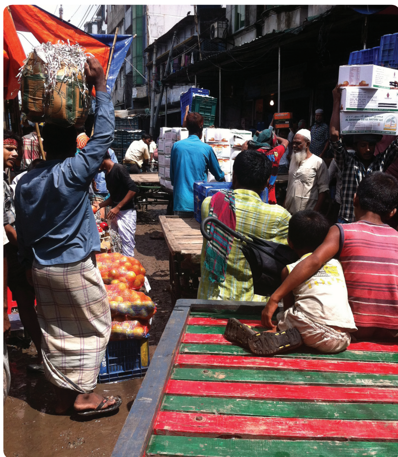
Market place in Bangladesh

Inclusive businesses often face a considerable challenge in creating consumer demand for new products or services. To add to the challenge, they need to ensure that pricing, payment mechanisms and access are right for the base of pyramid consumers. This Insider seeks to unravel this challenge, drawing on experience in the Business Innovation Facility portfolio.