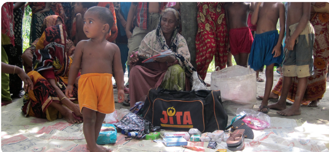
Jita sales woman in Bangladesh

Accessibility can also be achieved through innovative product design. Oando Plc redesigned their LPG stove cylinder to create a smaller lighter version that can be carried on foot, yet still meet tight durability and safety specifications.