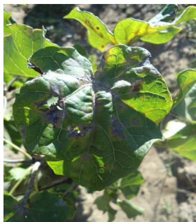
Diseased leaf – extension services are imperative to ensure good yields

BERL have an extension team and a lead farmer system that transfers knowledge on the economic and environmental benefits of growing Jatropha. This has resulted in a significant impact on the human skill base with regards to Jatropha production and utilisation knowledge. Extension services covered include: site selection, the boundary fence production model, pitting to facilitate good root development, gap refilling, and group nursery establishment. 82% of BERL farmers surveyed stated that their training expectations had been met with 74% saying the same regarding extension services.