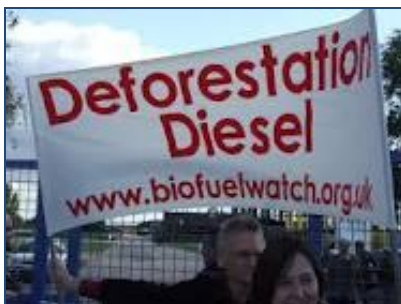
Biofuel protests

Oxfam (3) highlight the case of Sun Biofuels who intended to invest $20 million in Jatropha production over 8,200 hectares of land in Tanzania. 11 villages encircle this land and although uncultivated it is used by the villagers for charcoal-making, firewood, and collecting fruits, nuts, and herbs. There is also a water hole on the land that is the only water source during the dry season. Villagers have been assured they will receive monetary compensation, however, the amount is still highly uncertain. Jobs have also been promised, however, villagers are yet to receive written confirmation as to how many will be provided. This case study highlights the uncertainties faced by many communities involved in biofuel led land grabs. This is the primary reason NGO's, such as Oxfam and Actionaid, remain so skeptical of the promotion of biofuel production in developing countries.