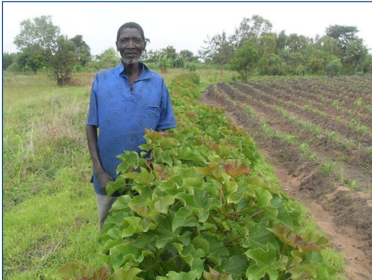
BERL farmer with Jatropha boundary fence

BERL only sources seed from farmers that are not growing Jatropha as a mono-crop. Although mono cropping would significantly reduce BERL's business risks it would also result in Jatropha directly competing with food crops for land. In turn, the World Food Programme's socio-economic impact assessment on the production of bio fuel crops concluded that BERL's smallholder business model would not negatively affect food security due to the nature of the boundary model.