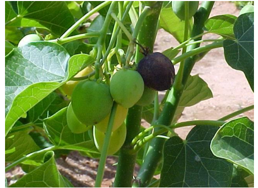
Jatropha fruit on a healthy bush

Many Governments and policy makers believe that biofuels have the potential to reduce net CO 2 emissions and improve energy security on a global scale. This perspective has been enshrined in EU policy under Directive 2009/28/EC, which requires member states to source a minimum of 10% of transport fuels from biofuels by 2020. Some academics have taken this proposition even further arguing that by 2020, 20% of all OECD gasoline demand could be met from biofuels produced in the global (developing) South (1) . They state that this would provide the developed world with a means of protecting biodiversity, helping developing countries prevent deforestation (thus reducing CO 2 emissions), “and helping shape an international regime of peace, security and economic development in the 21st century” .