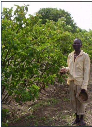
BERL Jatropha farmer with four year old trees in Malawi