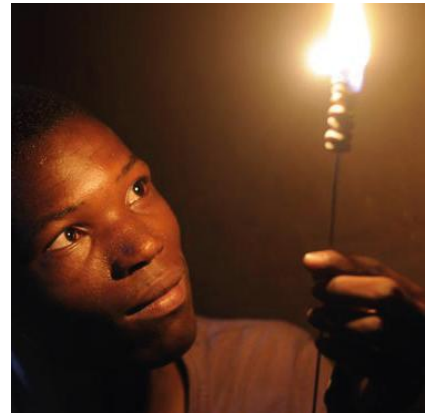
Jatropha used as a domestic energy source