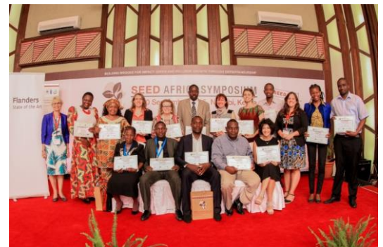
The 2015 SEED award winners