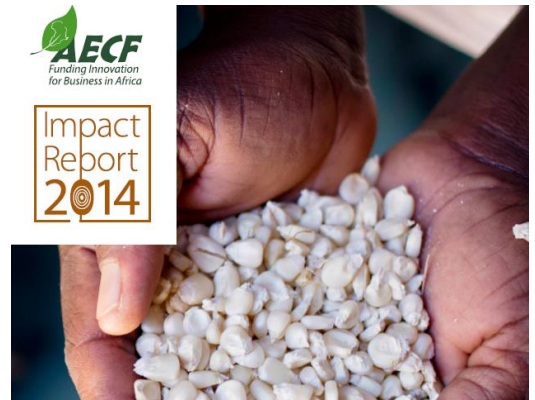
AECF has just released its first public Impact Report