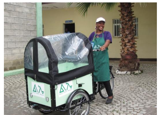
The Likie distribution model for Supermom in Ethiopia, supported by 2SCALE